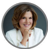
The Honourable Liza Frulla

Chairperson of the Board of Directors Sutton, QC